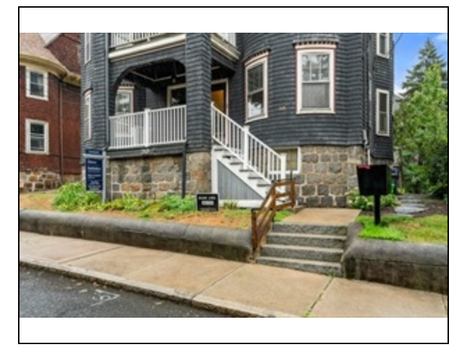
Exterior - Front