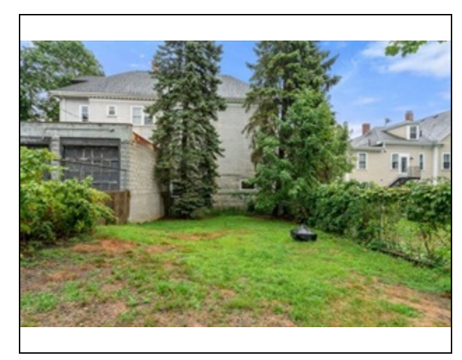
Exterior - Back