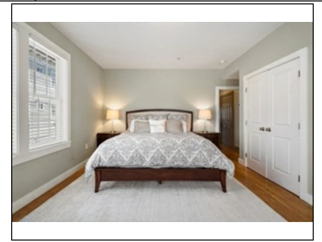
Bedroom - Main