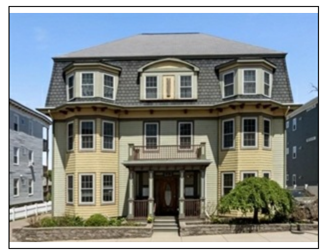
Exterior - Front